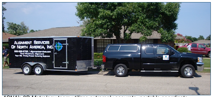
ASNA's 3D Metrology team utilizes extremely accurate, portable coordinate measuring machines.

The tracker that ASNA chose is the FARO® Vantage Laser