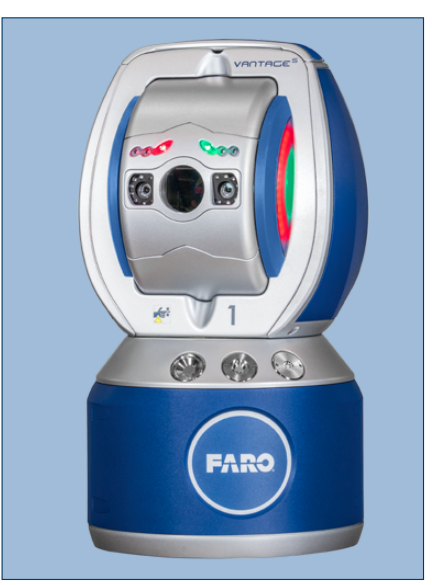
BuildIT Software and FARO® VantageS Laser Tracker

When Alignment Services of North America (ASNA) began using laser trackers and 3D inspection software, they and their customers began to discover how much more they could do with a 3D survey compared to precision optics.