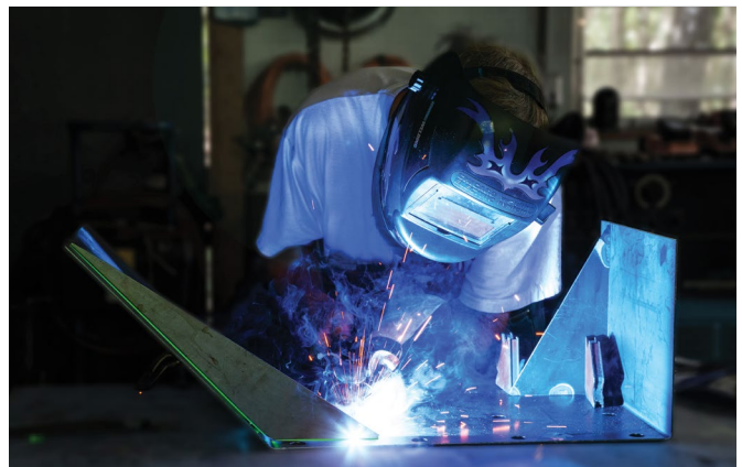
FARO TRACER LASER PROJECTOR Projects digital lines and shapes onto physical environments