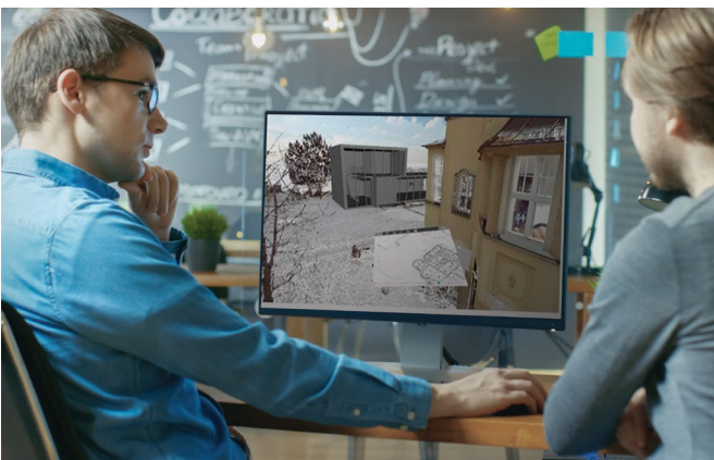
FARO SCENE SOFTWARE Software for accurate scanning and measurement of real world sets and locations

Plus, FARO products support numerous 3rd party data capture/design software and content creation tools.