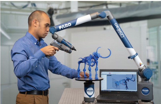
FARO 8-AXIS DESIGN SCANARM 2.5C Measure specialty props and set components