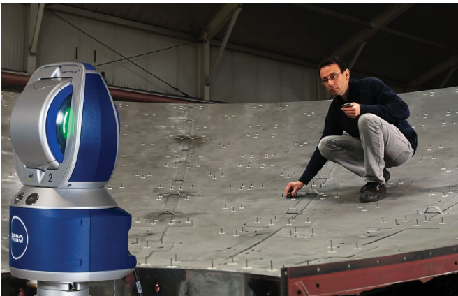
FARO VANTAGE LASER TRACKER Project CAD reframe points of a set onto an empty sound stage