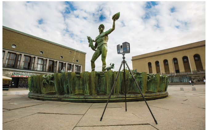
FARO FOCUS LASER SCANNER Survey locations for replication