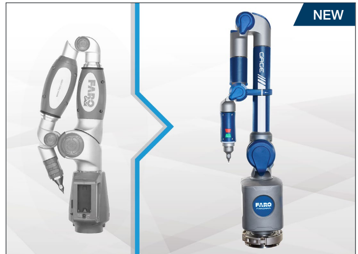
The All-New FARO Gage.

View more FARO case studies at www.FARO.com