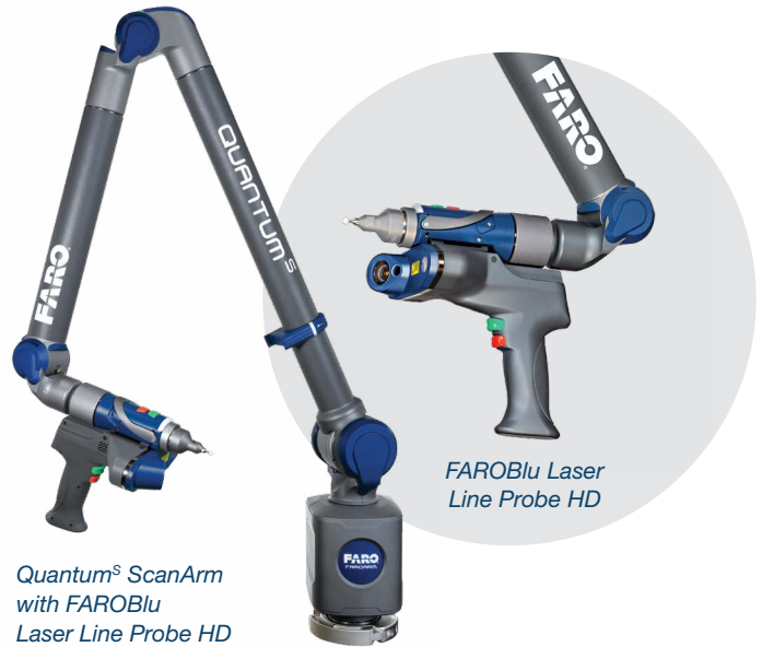
Quantum S ScanArm with FAROBlu Laser Line Probe HD