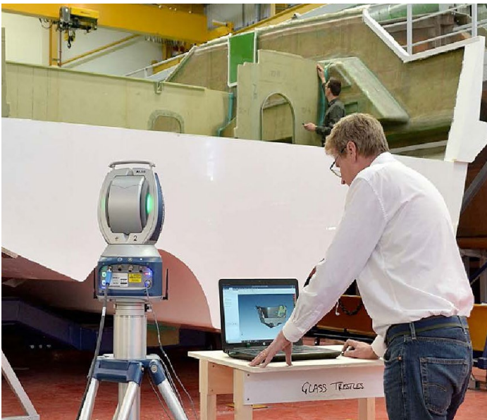
FARO Laser Tracker is set up to inspect the key positioning of components on the boat's hull.

Within the demanding marine sector, the accurate positioning, alignment and assembly of components, especially larger, cumbersome elements such as boats' hulls, is a regular and often challenging requirement. Famous superyacht builder, Sunseeker has eliminated the difficulties associated with these tasks following the recent purchase of two complementary, laser-based technologies from FARO UK. The cutting-edge FARO products have enabled Sunseeker to significantly reduce its build times and to further develop the company's renowned quality standards.