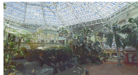
Colorized point cloud data collected using a 3D laser scanner

Phase-shift systems emit a laser beam at a known frequency ("light emitted"). Some of this beam is then reflected back to the system ("light returned"). The phase of this "light returned" is then compared to that of the known frequency, and the difference between the two peaks is the "phase shift". Phase shift scanners are considered to be among the most accurate laser scanning devices on the market, with very fast data acquisition and high-resolution scans.