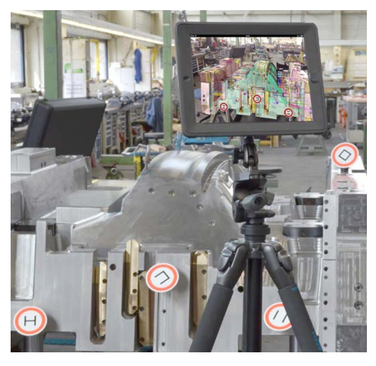
With the tablet's integrated camera, an overlay of the as-built object with virtual 3D data, including all process and workflow information, can be realized in real time.