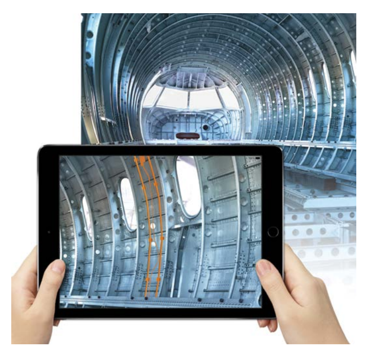
Visual Inspect Augmented Realiy is a cost-effective mobile solution to streamline inspection and documentation tasks.

In the past, complex CAD (computer-aided design) data was not available to all areas of a company, and moving large amounts of industrial data was difficult. However, today it is possible to share large amounts of data with only a tap on a mobile device. The data can be seamlessly transferred from the device and put into action. If you're looking for a way to streamline production, you may want to consider this new approach.