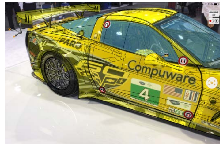
Availability of complex 3D data and Augmented Reality in all working environments, allows for quality assurance processes, wherever and whenever.

When marker placement is not possible, such as for very large assemblies or space limitations, an overlay can still be created by connecting 3D points on a CAD model with 2D points in one corresponding image. Operators can take pictures and overlay CAD data and pictures at a later time. Overlays can be reproduced anytime and anywhere.