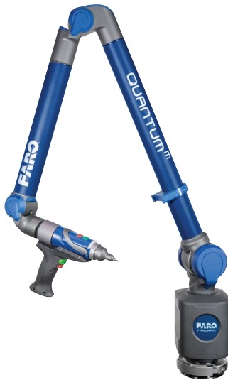
FARO® Quantum M ScanArm