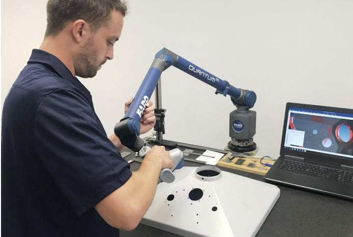
FARO Quantum ™ ScanArm and CAM2 inspecting a cover for a medical diagnostic device

ICP paired the Quantum with FARO CAM2 ® 3D measurement software. With intuitive workflows and insightful reporting capabilities, CAM2 delivers perfect alignment with FARO hardware to gather measurement data anywhere in the production environment. It provides a seamless and easy measurement experience for all users, along with accurate and comprehensive insight into measurement results, without the need for extensive training or expertise.