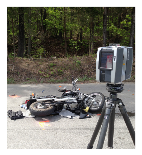
Figure 3. Setting up and starting the scanner quickly, a great deal of data can be captured before any changes have occurred

Crash scenes can be highly dynamic, but by starting the scanner quickly, a great deal of data can be captured before any changes have occurred ( Figure 3 ). Jones explains, "Imagine a large crash scene. It's much harder to lock it down and control the investigation than in a typical crime scene. There will be people moving through it, vehicles may be hauled off so the road can be opened. By the time we could get set up and shoot this with a total station, this dynamic scene will have changed. It may even change enough to get some of the evidence we present excluded from court, especially if photographs show that evidence was moved or changed. Efficiency and speed are the keys to preserving evidence and laser scanners can provide us with both."