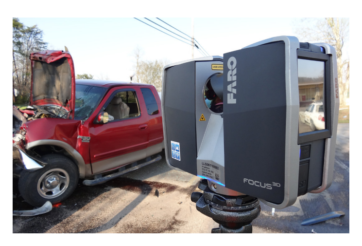
Figure 2. Setting up the scanner at a crash site is quick and easy and eliminates the need for a Total Station.